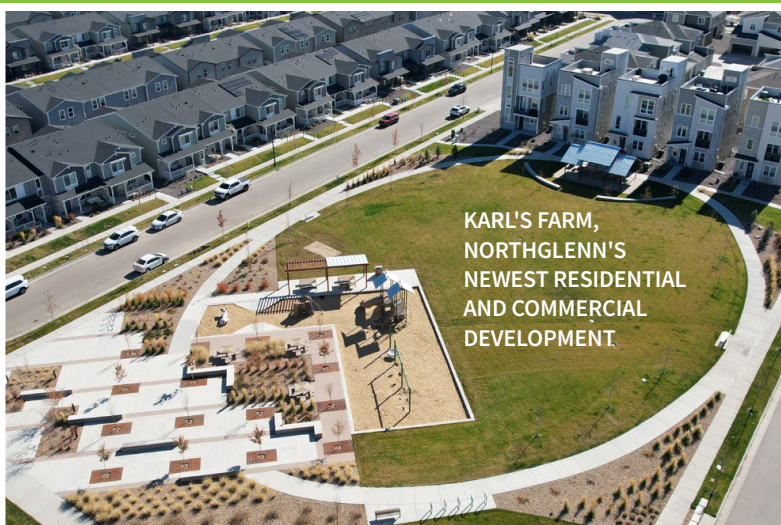
KARL'S FARM, NORTHGLENN'S NEWEST RESIDENTIAL AND COMMERCIAL DEVELOPMENT